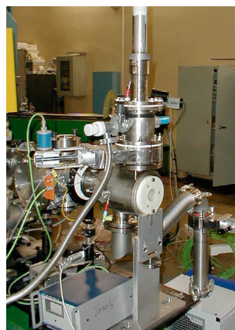
Fig. 1. The overall view to the target station of NPI p- 7 Li neutron source.